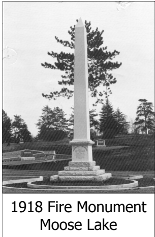
1918 Fire Monument Moose Lake

On October 12, 1918, many small fires in northeastern Minnesota converged to produce a massive firestorm, sweeping through an area from Sturgeon Lake to the northern fringes of Duluth. In its path were the communities of Lawler, Automba, Kettle River, Moose Lake, and Cloquet.