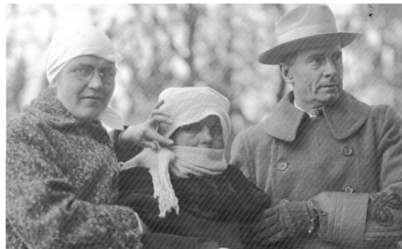
1918 Fire Survivors, Moose Lake

The Moose Lake Depot and Museum is located on the Soo Line bypass of the Willard Munger State Trail. The building is listed on the National Register of Historic Places.