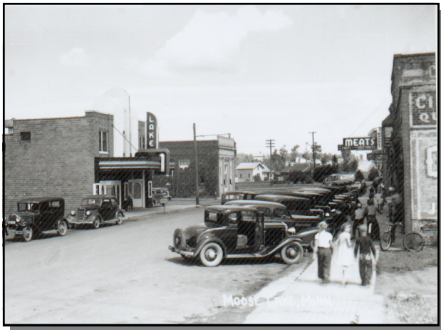
Elm Avenue, Moose Lake, in the 1930s